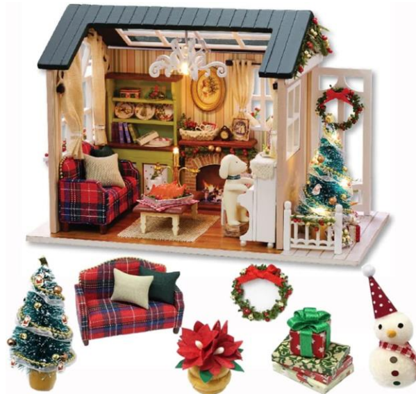
2 nd Prize: Holiday Time Complete-It-Yourself Miniature Room