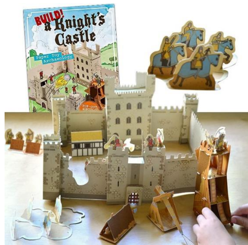
3 rd Prize: 3D Papercraft Medieval Castle